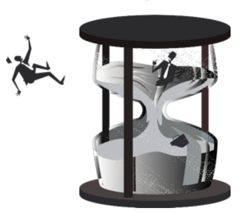
For while we were still weak, at the right time Christ died for the ungodly. (Romans 5:6)